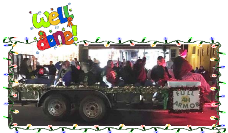
Full Armor 4-H Club is looking good in Henderson parade!