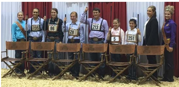
Outdoor Challenge—Seguin, Texas